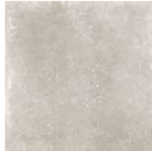
TOWN GREY 59,5x59,5 cm R34 MATE RECTIFIED