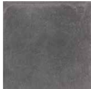
TOWN BLACK 59,5x59,5 cm R34 MATE RECTIFIED