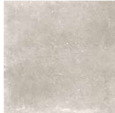
TOWN GREY 75x75 cm R34 MATE RECTIFIED

PORCELAIN TILE 3 COLORS_ GREY / BLACK / TAUPE 3 SIZE_ 29,52"x29,52"RECTIFIED(75x75cm)/MATT 23,43"x23,43"RECTIFIED(59,5x59,5cm)/MATT 11.61"x23,43"RECTIFIED(29,5x59,5cm)/MATT