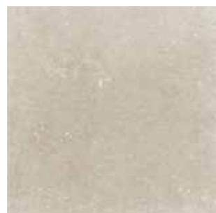
TOWN TAUPE 59,5x59,5 cm R34 MATE RECTIFIED