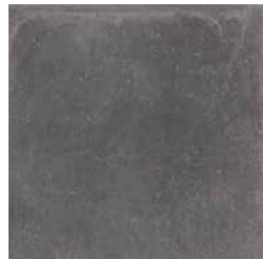
TOWN BLACK 75x75 cm R34 MATE RECTIFIED