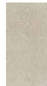
TOWN TAUPE 29,5x59,5 cm R34 MATE RECTIFIED