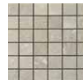
MALLA TOWN TAUPE 30x30 cm R34 MATE