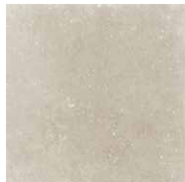
TOWN TAUPE 75x75 cm R34 MATE RECTIFIED