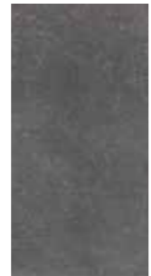
TOWN BLACK 29,5x59,5 cm R34 MATE RECTIFIED